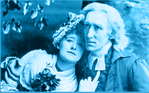
Henry Irving and Ellen Terry