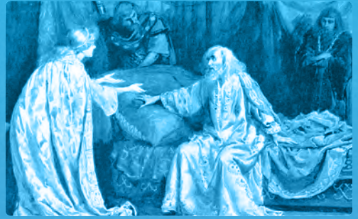
Henry Irving and Ellen Terry