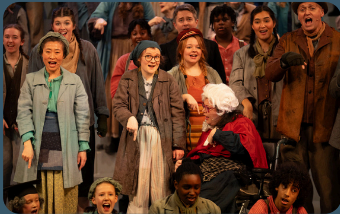
Above: The Company using BSL integrated in the finale song

An overwhelming majority of participants said that being part of the production helped them feel that they belonged. Participants reported developing connections, making friendships and feeling part of a community. The inclusive approach to casting meant access wasn’t an add-on, but at the heart of the production. Two full scenes were led by D/deaf and learning disabled actors, and every performance was live BSL-interpreted.